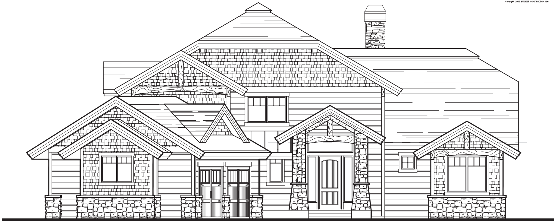
FRONT ELEVATION BLACKHAWK LOT # 4